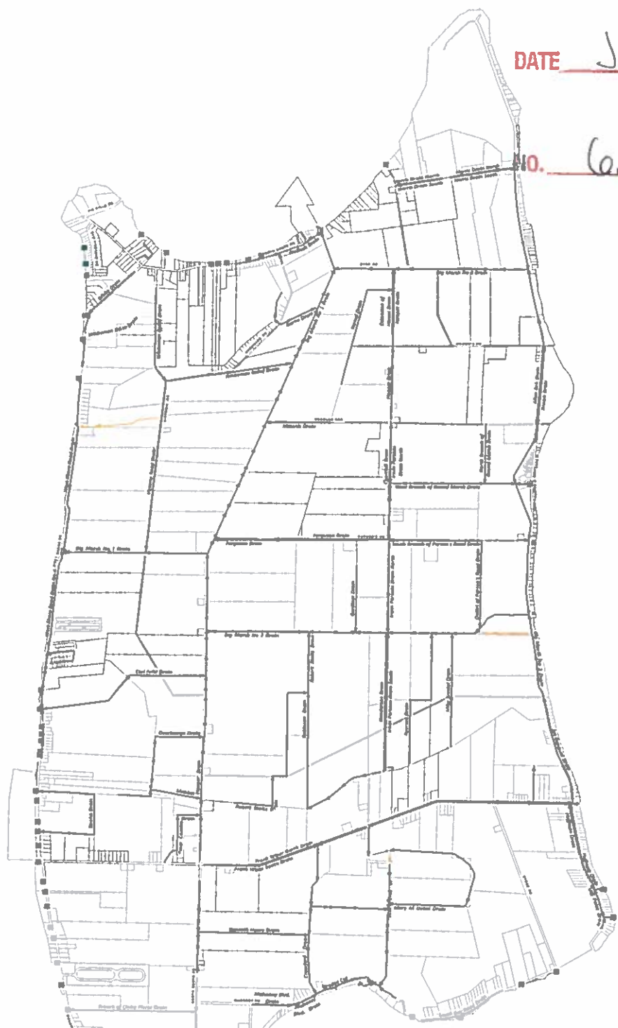
Pelee Island Base Drainage Map